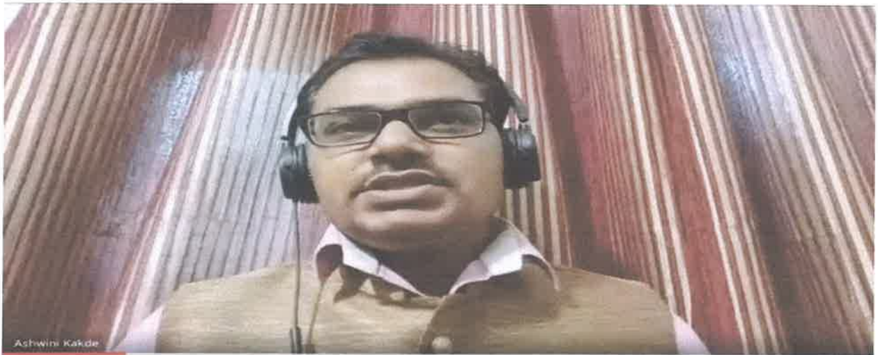
“significant role of Life Science in pandemics like Covid-19”